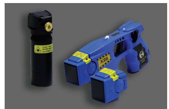
Chemical Agent and TASER®

The Content Production Kit provides all of the necessary video equipment to record accurate branching situations for the PRISim Suite judgement trainer. The primary components are a professional quality tripod, portable Mini HD DV VTR with LCD monitor, Mini HD DV Camera; and all necessary cables and batteries. The Content Production Kit is supplied with a hard case for easy transport and protection of your equipment.