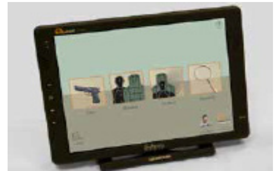
Wireless Touchscreen Tablet

The wireless touchscreen tablet allows instructors to control the training session from the convenience of a wireless tablet. The mobility, convenience and flexibility of the tablet gives the instructor the ability to carry it anywhere, with full system control. The touchscreen tablet has a battery life up to 4 hours, with a 12.1” screen and connects via Wi-Fi.