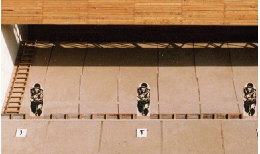
300m outdoor range