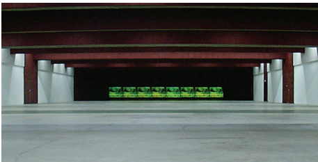
100m indoor range with targetry and live-fire simulation

Our designs use the most advanced specialist range equipment including ventilation, bullet protection, targetry, simulation, and safety and monitoring systems.