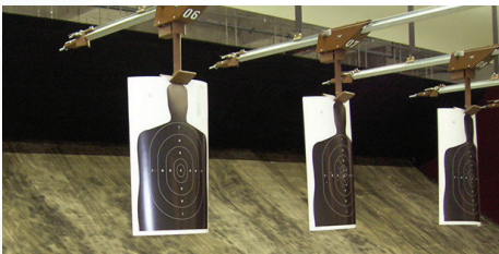
Indoor range with overhead retractable targets